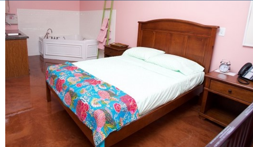
Each patient has access to a birthing tub, full size bed, and proficient midwifery support.