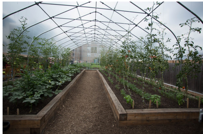
An all-season hoop house grows multiple varieties of tomatoes while raised garden beds surrounding the structure are filled with produce such as collard greens, sweet potatoes, and giant zucchinis. Produce is sold weekly at the PCC Austin Produce Market.

In order to respond to these inequities, PCC provides residents access to an on-site produce market that sells fresh, affordable produce grown from the farm. The PCC Austin Farm also allocates personal plots to eight families each year through an allotment program. Through the PCC Austin Farm, PCC will engage community members with volunteer opportunities as well as farming and nutrition workshops.